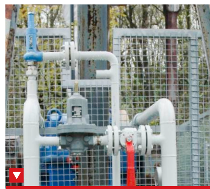
Blowoff valve with back pressure regulators. They are used to avoid damage to or overloading of the pump support.