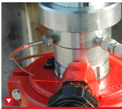
Double gland screw connection with leakage connection. It prevents gas from escaping. Only leaks are fed back to the probe cellar through separate pipes.

Kremsmüller Beam Gas compressors are double-action piston compressors specially designed for being driven through pump supports. Owing to the up/down movement of the balancer, gas is sucked out of the casing chamber and simultaneously compressed to production line pressure and pressed in. A