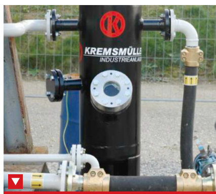
To protect the compressor from impurities, a baffle plate separator can be fitted in the inflow pipe. It is also available in the sour gas version according to NACE MRO 175.